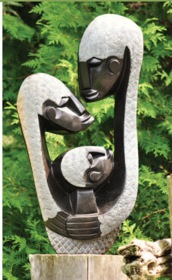
Becoming a Family