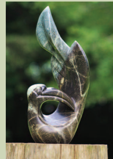
Under My Wing