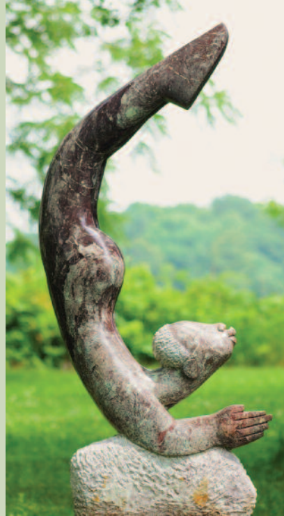
Full of Energy

givemoremashaya@yahoo.co.uk +263912612521