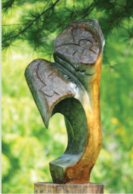
Story of Love