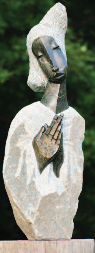
Let Us Pray

ZimArt's Artist-in-Residence, 2010 ZimArt's Rice Lake Gallery