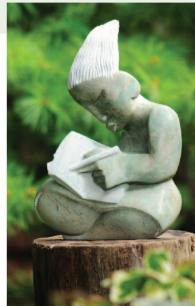
Writing my Diary