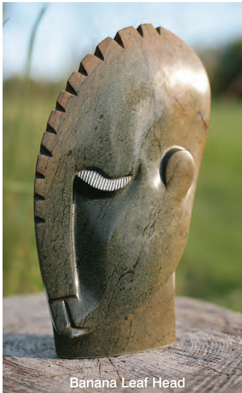
Banana Leaf Head