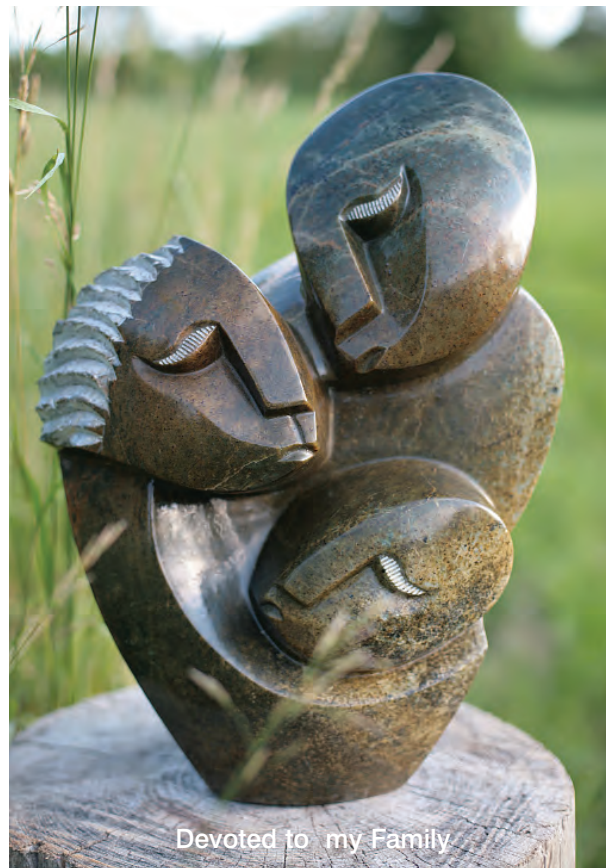
Devoted to my Family

his stone with great care, favouring the exceptionally beautiful fruit serpentine from one particular mine near Guruve.