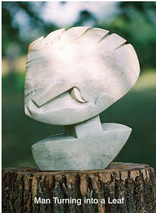
Man Turning into a Leaf