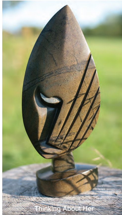
Thinking About Her